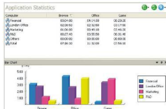
Gather application statistics by department